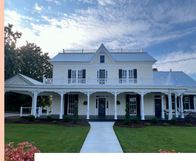
The R.G. Strickland House Home of The Madison County Chamber of Commerce

"I am thrilled to see the opening of our new office in the beautifully restored Greene Family historic home. The office stands as a monument that symbolizes a bright future filled with opportunities for smart growth, collaboration and community pride."