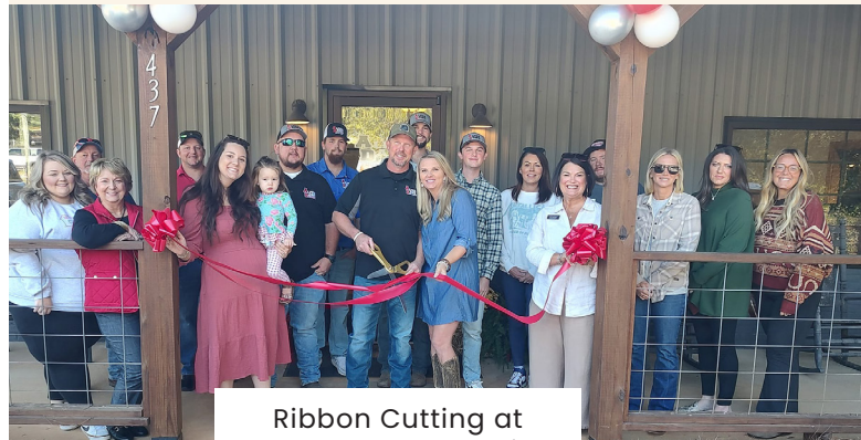
Ribbon Cutting at Alpha Dawg Plumbing

In-Person Members Visits Through Ambassador Ambushes 183